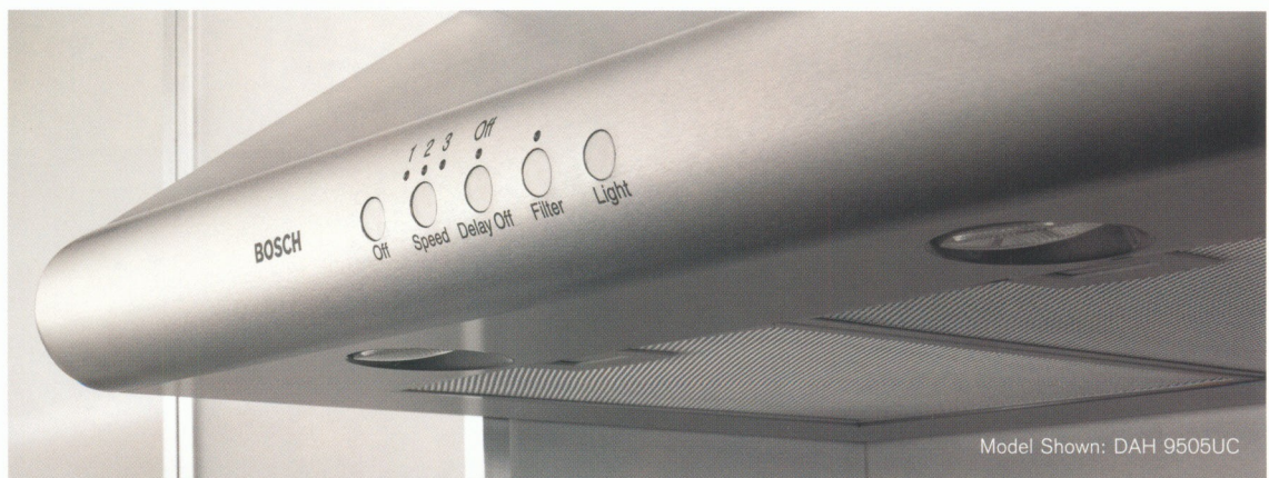
Model Shown: DAH 9505UC

10" x 30" x 22" 10" x 30" x 22" 10" x 30" x 22" 10" x 36" x 22" 10" x 36" x 22"