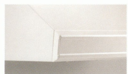
CHANNEL DAH 93 DAH 94