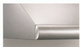
HALF-ROUND DAH 95